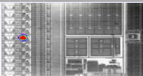
• Semiconductor inspection