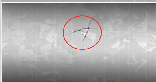
• Semiconductor inspection