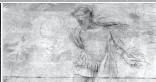
• Art inspection